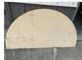
67” wide x 36” tall