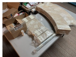
Helix Kit – Manufactured by Affordable Model Railroads