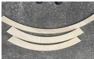
¾ Inch Circular Plywood 42” x 38” x 4” 36” x 30” x 6” (2)

Double Track Truss Bridge Abutment – 933-1040 (4)